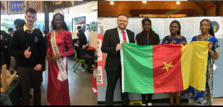
(Top) All of our participants together. (Left) Ms. Universe (Right) The Cameroon flag unfurled proudly